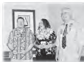
Gardner Dozois, Eileen Gunn, David Hartwell