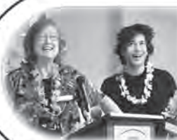
Connie Willis, Neil Gaiman

Special room rates, $131.00 per night, are available for the weekend at the Best Western Executive Inn right across the street from the Experience Music Project/SF Museum, at 925 Westlake Ave., Seattle WA 98109. There are a limited number of rooms at this price; for hotel reservations, call (206) 674-6616 and mention the "Science Fiction Awards Group".